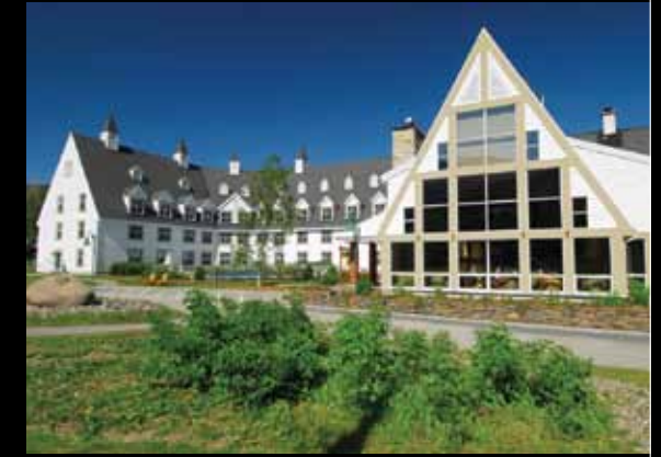
HIKING; CHIC CHOC MOUNTAINS Gaspésie (Provincial) National Park, Quebec Gîte du Mont-Albert, sepaq.com

Québec's legendary Chic Choc Mountains are rugged, austere and wild — none of which describes the Gîte du Mont-Albert, the four-star, 48-room lodge located in the heart of Gaspésie National Park. Guests can indulge in saunas, fine regional cuisine or cocktails in the solarium. Of course, all of the above will be more enjoyable after a day hiking on the Chic Choc's tabletop mountains that surround the Gîte. This terminal end of the Appalachian Mountains is home to the only herd of woodland caribou south of the St. Lawrence River. Prime viewing habitat is found on the eight-kilometre, round-trip hike to 1,2570-metre Mont Jacques Cartier, the second-highest peak in the province. The peaks here are more like plateaus of alpine tundra, making summit bids gentle and leaving views of the Gulf of St. Lawrence panoramic. Guests can book a park warden naturalist for $50 an hour, but the trails are well-marked, information panels abound and off-the-clock wardens are frequent sightings on the trails. The park's visitor centre is right beside the Gîte and offers trail information and bus shuttles to destinations like the trailhead for Lac Aux Américains, a stunning lake situated down a gentle 2.6-kilometre trail.