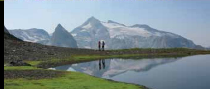
ALPINE HIKING; DURRAND GLACIER Selkirk Mountains, British Columbia Selkirk Mountain Experience, selkirkeexperience.com

There are no roads to the Durrand Glacier Chalet. It sits at almost 2,000 metres, high in the Selkirks east of Revelstoke. Once the helicopter has dropped you off and retreats out of earshot, you are on your own with 19 other guests, a handful of guides and housekeepers, a chef and some 20 resident mountain goats. Step off the porch and into an alpine meadow at the start of Selkirk Mountain Experience's own 80-kilometre network of trails. Two guided hikes leave each day. The more challenging might be gone six hours and cover 15 kilometres; another might take a more leisurely route following streams up to the glacier itself to collect ice for afternoon refreshments back on the porch. Or, wander on your own: there are alpine lakes in every direction. Pick the right trail and you'll find the one lake just warm enough to swim in.